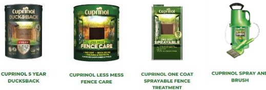
Cuprinol Fence Treatment Products

Although your new fence does not need to be waterproof the application of a suitable exterior timber care product such as a good quality fence paint from the Cuprinol or Protek range of paints, which have various tints and colours that are brush or spray applied, will help prolong the life of your new fencing. Please download our care sheet for your new fencing from our website. FENCE PANEL CARE SHEET LINK