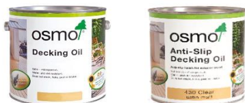
OSMO Decking Oil