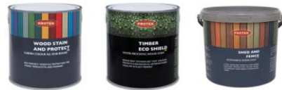
Protek Fence Paint