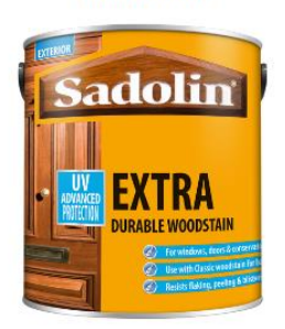
Sadolin Extra Durable Woodstain