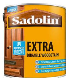
Sadolin Extra Durable Woodstain