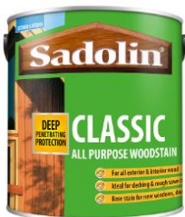
Sadolin Classic All Purpose Woodstain

Sadolin Extra is a durable woodstain particularly suitable for your Premium Range timber gate, where it's flexible nature and water repellent qualities provide for long lasting protection. For optimum durability on new wood, the use of Sadolin Classic as a base coat is recommended. ( please apply 2 coats of these products as a minimum for the first treatment and carefully follow the manufacturer's guidelines for re-treatment ).